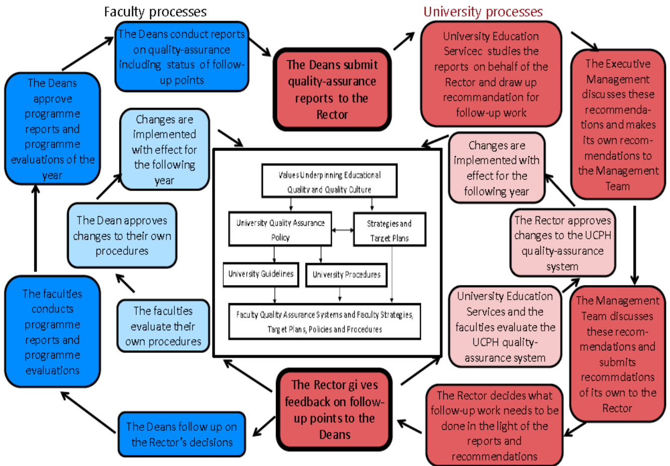
Figur 2. Evaluation of the quality-assurance system